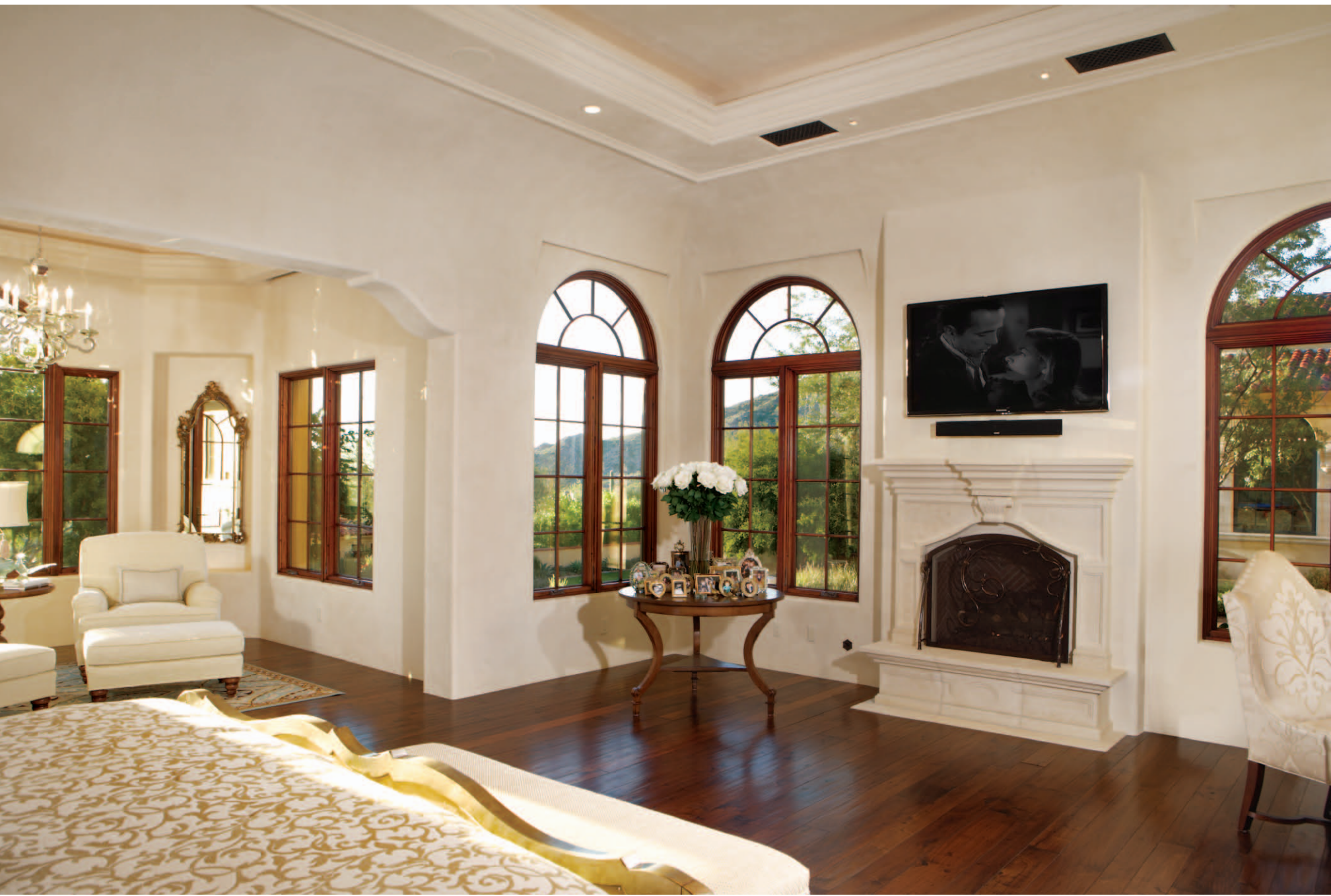
Soft colors, refined textures and expansive views turn the master suite into a tranquil haven, complete with a private reading nook.