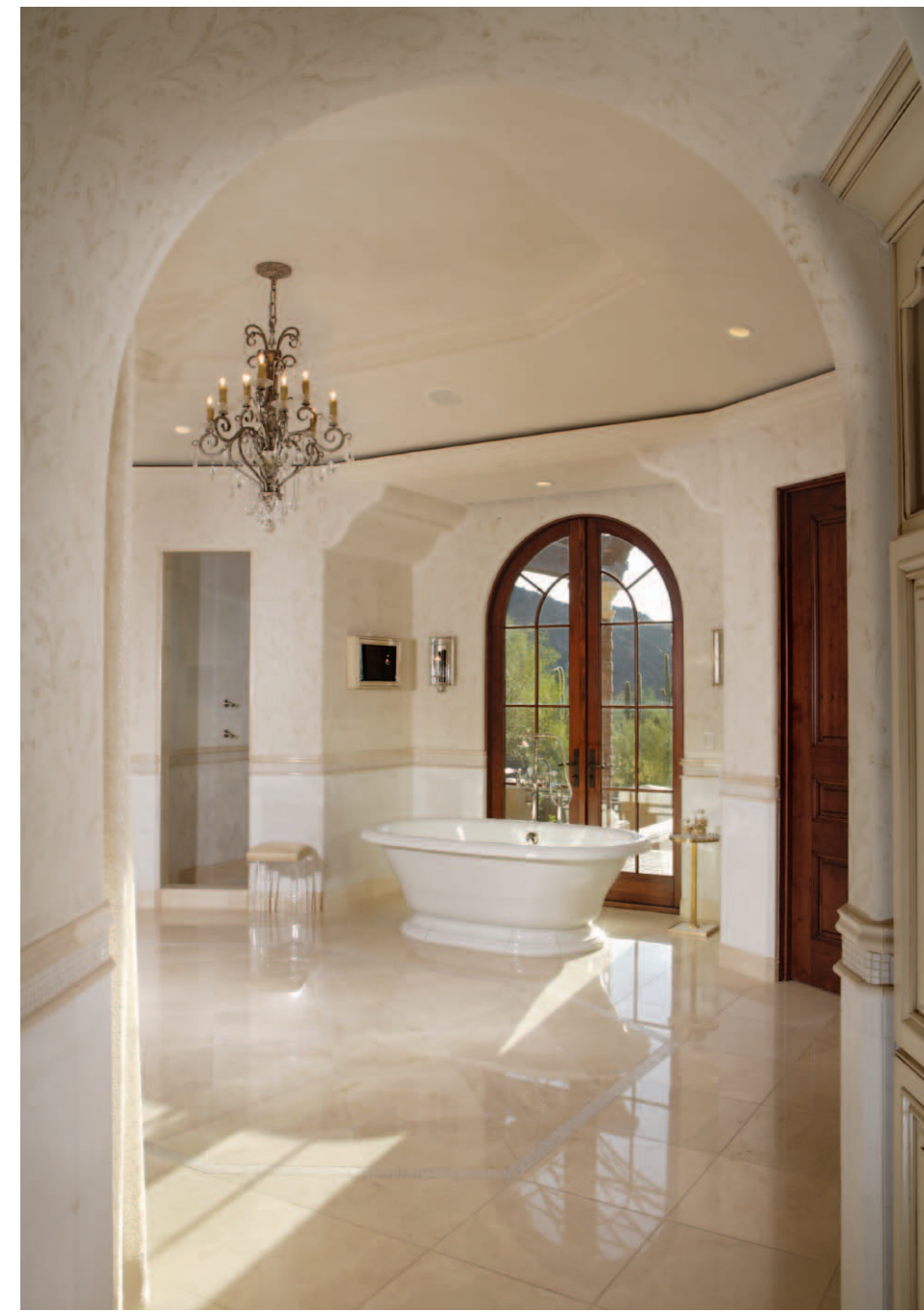
Marble flooring and Lace Venetian plastered walls exude an aura of elegance in the two master bathrooms that are adjoined by a private courtyard.